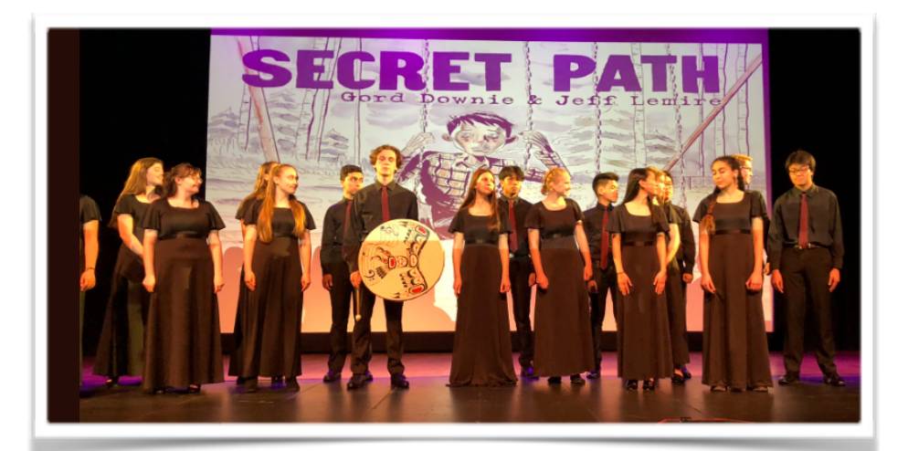
Carson Graham Secondary Choir